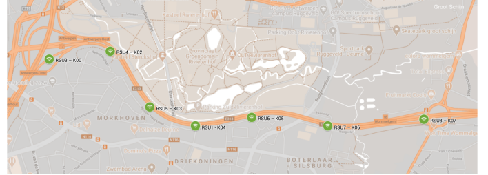
Fig. 1. Location of the RSUs along the Smart highway testbed implemented on top of the E313 highway in Antwerp, Belgium [4]

In this paper, we present and demonstrate a portable software tool to investigate how the CAM messages affect the latency, in case they carry different amounts of information. In particular, we consider latency as a total time needed for communication (transmission delay over ITS-G5 and LTE-V2X) and computation (constructing CAM message, encoding, decoding). Our demo setup is built on the real-life testbed, Smart Highway (Antwerp, Belgium), and for the performance evaluation it