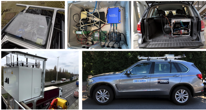
Fig. 4. Smart Highway testbed test vehicle [4]

components: i) the CAM message generator, ii) the CAM message decoder, and iii) the latency calculator. Within the CAM message generator we can specify the type of a CAM message, such as regular CAM message, i.e., a CAM message that consist only of its two mandatory containers. The other option is to send a Full CAM message, i.e., a CAM message that consists of its two mandatory, and two optional containers. This demo also provides insight into the process of selecting the technology type, i.e., ITS-G5 or LTE-V2X, thereby considering