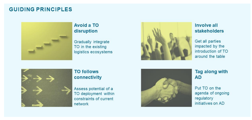
• Figure 4: Key guiding principles