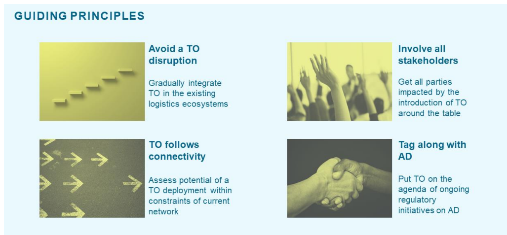
• Figure 4: Key guiding principles