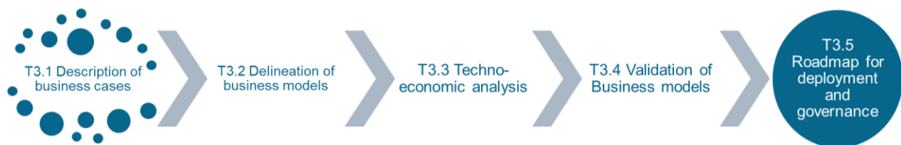
Figure 1: Overview of tasks on governance and business models in the 5G-Blueprint project

The scheme below clarifies the logic of the workflow realized, along with the corresponding reporting: